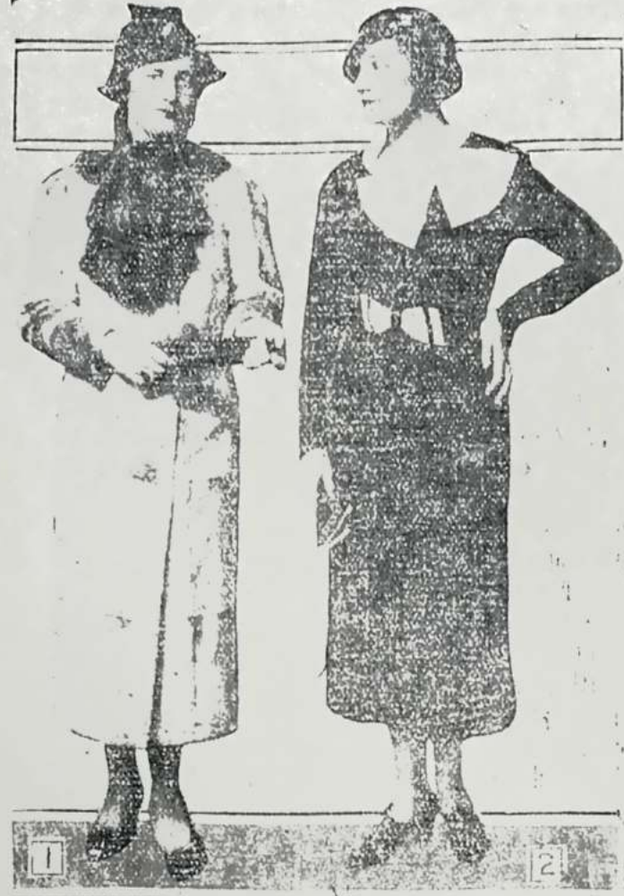
Here are seen two of the smart Pan collar and Ascot tie in warm fashions among those being shown now for fall wear. (1) A youthful coat in French Lapin, fashionable beige with a smart contrast in Peter Pan collar and Ascot tie in warm autumn brown. (2) The white neck-line adds a dash of flattering color to this good-looking day-time frock in crepe.