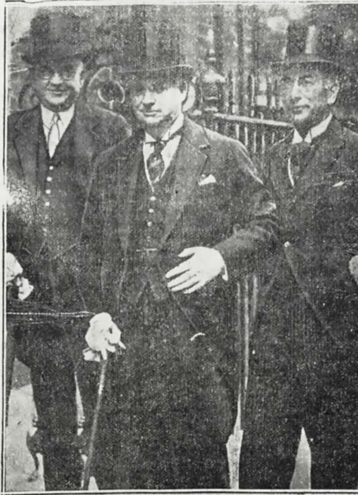
The Canadian delegates to the World Economic Conference and Canada's high commissioner to Great Britain called upon the prime minister at No. 10 Downing st. the other day. Hon. G. Howard Ferguson, Rt. Hon. Richard Bedford Bennett and Hon. Edgar N. Rhodes are shown in the above picture.

The Oil for the People. —Many oils have come and gone, but Dr. Thomas' Electric Oil continues to maintain its position and increase its sphere of usefulness each year. Its sterling qualities have brought it to the front and kept it there, and it can truly be called the oil of the people. Thousands have benefited by it and would use no other preparation.