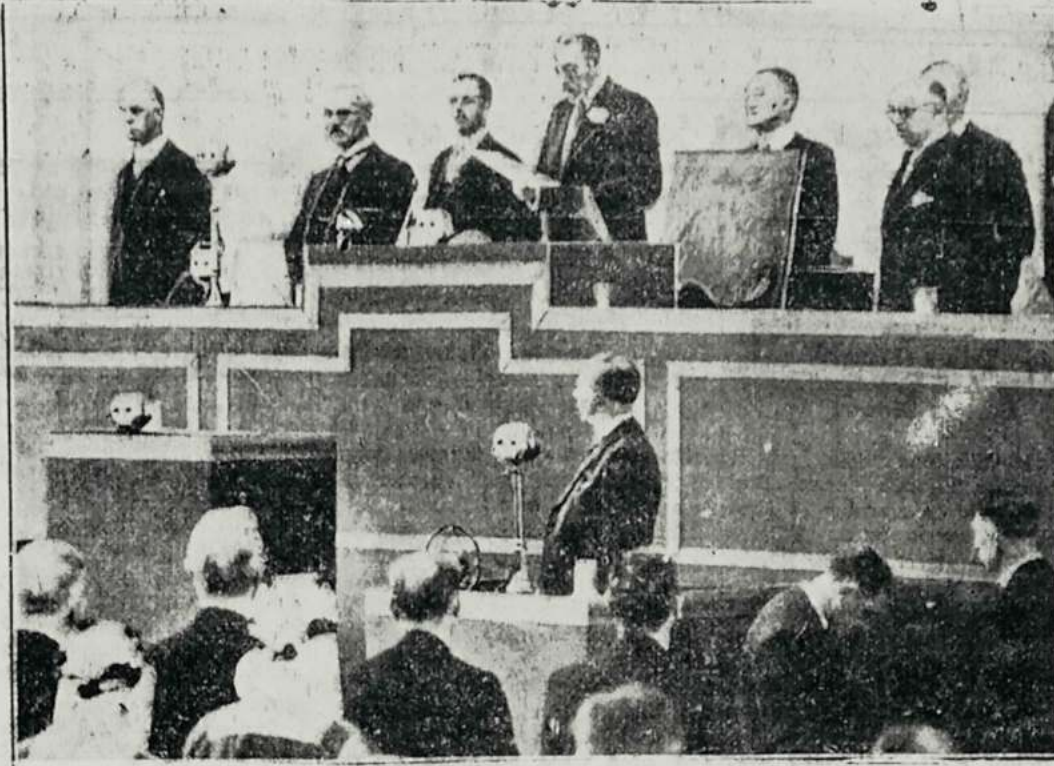
Welcoming delegates of 69 nations, and appealing for world-wide cooperation, King George of England

is shown addressing the World Economic Conference the opening day, June 12. The conference is meeting