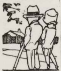
Ain't Nature Grand

Tomorrow is Mother's Day, but father has his innings every day.