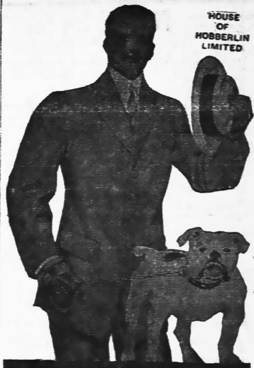
HOUSE OF HOBBERLIN LIMITED

Winter Baking Ladies can save lots of work and worry by buying their baking at MacTAGGART'S Phone 116.