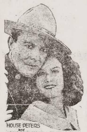
HOUSE PETERS and JOAN CRAWFORD in "ROSE-MARIE"

Everyone who knows anything of theatrical matters has at least heard of "Rose Marie," the big musical comedy that played two years on Broadway and many engagements in Toronto; now it has been brought to the screen by Metro-Goldwyn with a picked cast featuring Joan Crawford and House Peters. The scenes of "Rose Marie" are laid in Canada, a fact which lends special interest to the picture, which comes to the Royal Theatre for three nights beginning Monday. The musical accompaniment will include all the tuneful hits of the stage production.