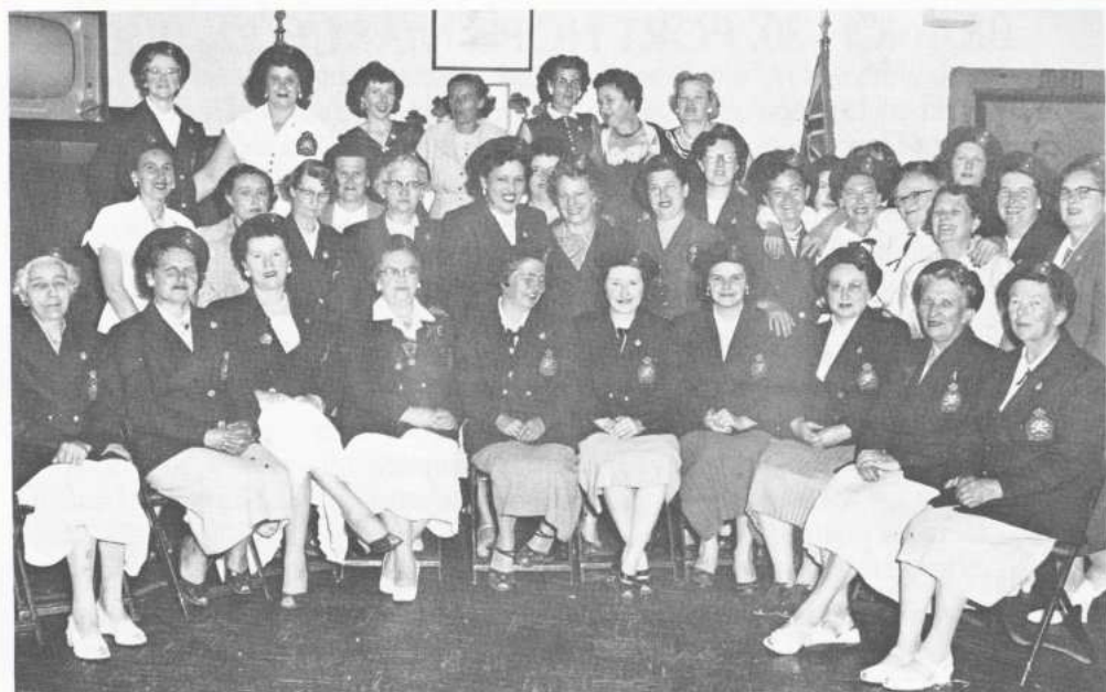
Charter Party Members and Guests July 6th, 1956